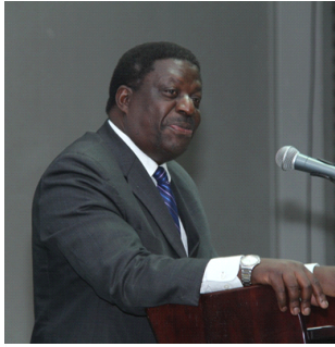
Hon. Mike Bimha Minister of Industry and Commerce

The conference was officially opened by Hon. Mike Bimha the Minister of Industry and Commerce.